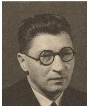
Jaromir Funke 1896 – 1945.