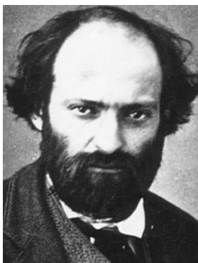
Paul Cezanne 1839 – 1906.