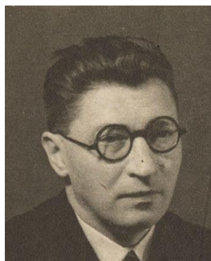
Jaromir Funke 1896 – 1945.