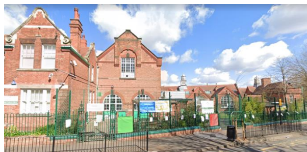
Grove Primary School