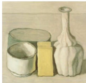
Natura morta (still life) 1929