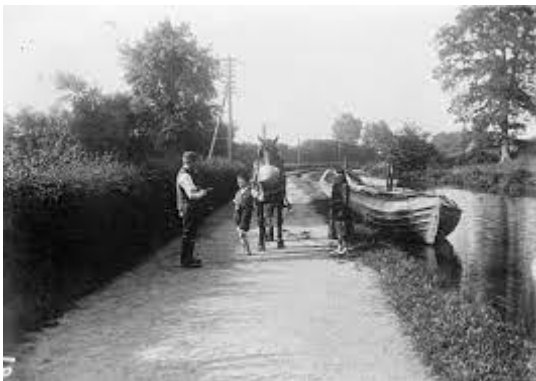
Horse-drawn canal boat

James Brindley, engineer, 1716-1772, Georgian period, pioneering, construction, Bridgewater Canal, bridge designs, Staffordshire and Worcestershire Canal, Harecastle Tunnel.