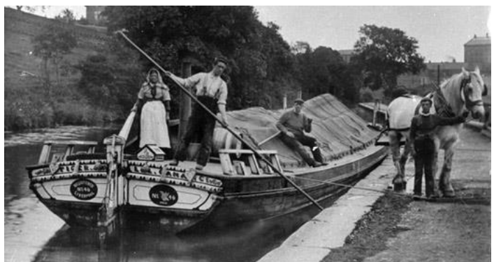
Horse-drawn canal boat