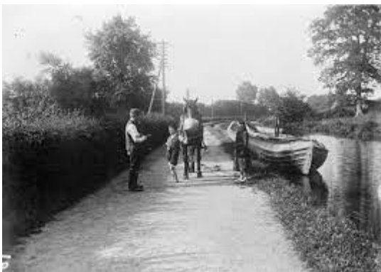
Horse-drawn canal boat

James Brindley, engineer, 1716-1772, Georgian period, pioneering, construction, Bridgewater Canal, bridge designs, Staffordshire and Worcestershire Canal, Harecastle Tunnel.