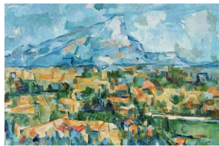
Mount Sainte Victoire (1895 left, 1904 right)