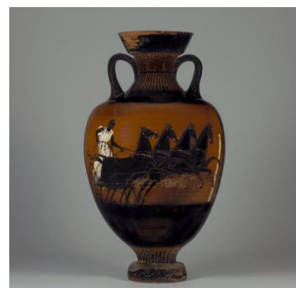
Chariot Race on Pottery