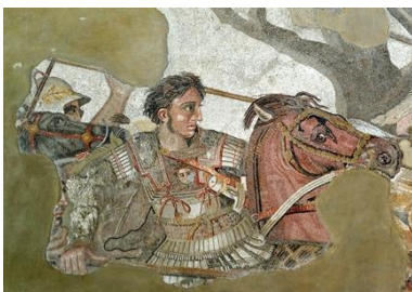
Alexander The Great

Ancient, Greeks, Greece, Empire , modern, Athens, Sparta, significant, Europe, Middle East, North Africa, city states, laws, money, rulers, rivals, artefacts, pottery , statues, soldiers, gods, goddesses, Alexander the Great, friezes, chronological sequence, achievements , plaque, society, Olympic Games, memorable moments, legacy, citizens, politics , flute, lyre, military school, warriors , Olympia, religious festival, honour, Zeus, wreath of leaves, messengers, sacred truce, sacrifice, altar, boxing, wrestling, discus, gymnasium, javelin.