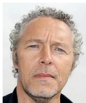
Julian Opie (b. 1958)