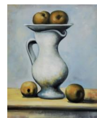
Still life with pitcher and apples 1919 (drawing and painting)