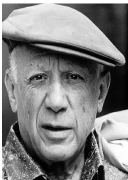
Pablo Picasso 1881-1973

Opinion, like, dislike, favourite, hypothesise, assess, judge, argue, examine, relate, summarise, express