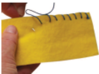
An over sew stitch

Over sew stitch, seam, seam allowance , fastening, compartment, applique, 2D, 3D.