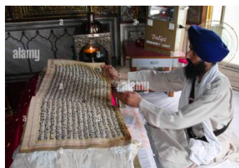
Guru Granth Sahib