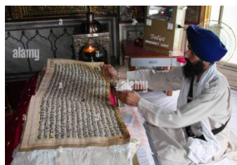
Guru Granth Sahib