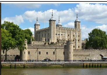
The Tower of London