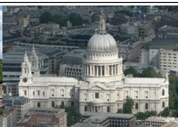
St Paul's Cathedral