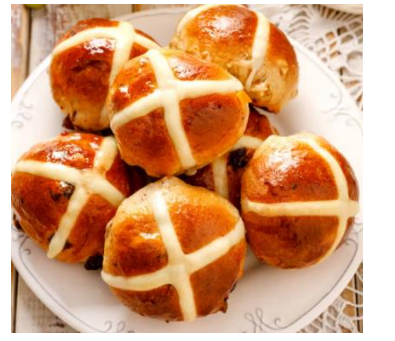
Hot cross buns