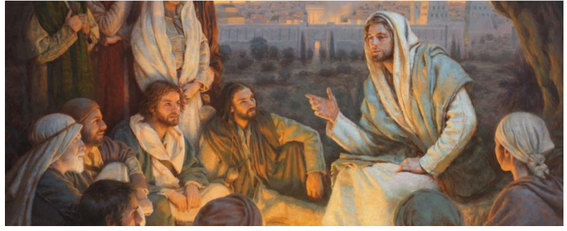
Jesus and his disciples

Christians, Easter, church, Jesus, disciples, loyalty, forgiveness