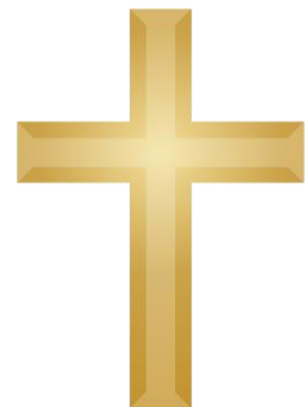
Symbol of Christianity