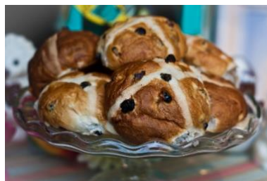
Hot cross buns