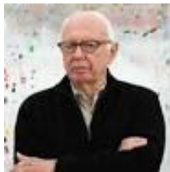
Ellsworth Kelly 1923-2015

Apply, vertical, horizontal, ferrule, handle, bristles, size, primary colour, secondary colour, artist, artwork